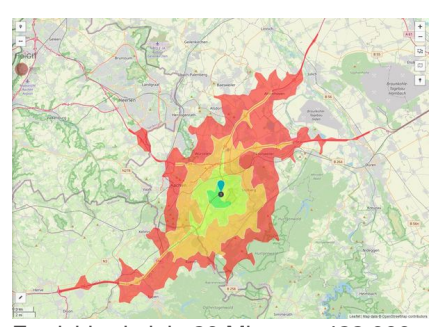
Erreichbarkeit in 20 Minuten: 422.000