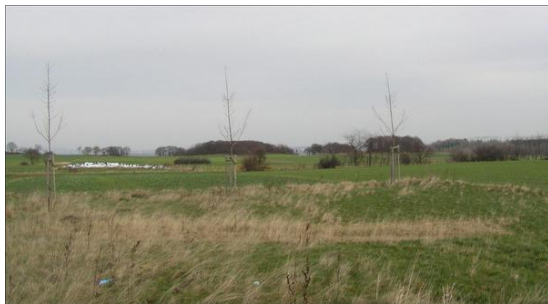
Geplantes Gewerbegebiet Gey