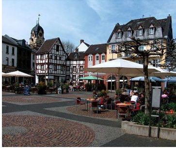
Alter Markt, Euskirchen